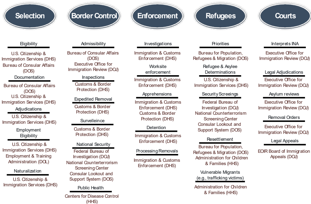
Figure 2. Major Federal Immigration Responsibilities: Selected Functions and Lead Agencies

These agencies house administrative, demographic, and workload databases that have personal records for screening and other purposes.