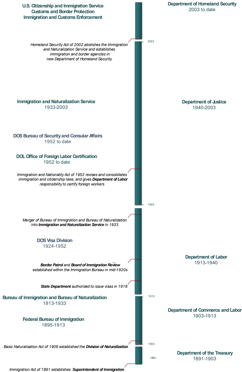
Figure 1. Timeline of Immigration Governance in the United States